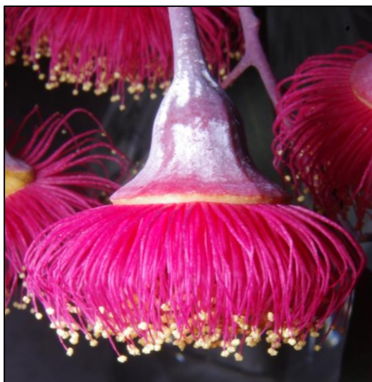
Close-up of a Eucalyptus caesia flower. This beautiful pink flower lasted several days in water after the July meeting. It stayed at this degree of opening, which was quite an artistic curved shape.